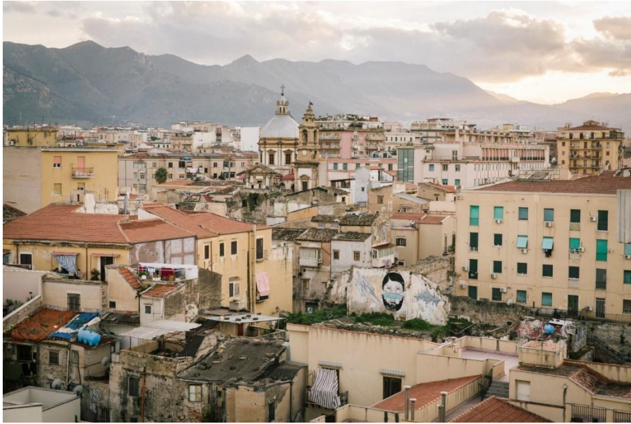
Photo of Palermo